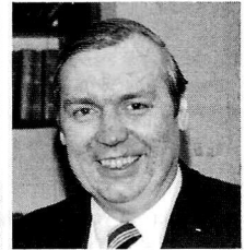
STEPONKUS New Title