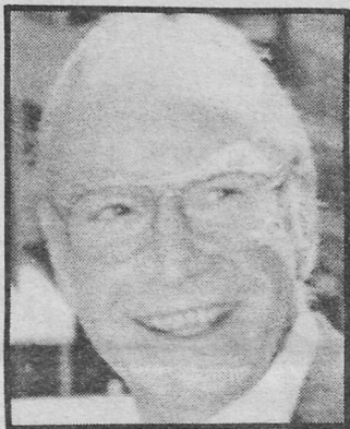
JIM WRIGHT In seclusion