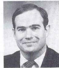
GREENER New Job