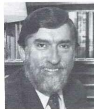
KLING New Role